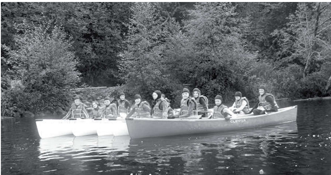
CPF celebrates its new partnership with the Centre de leadership et d'aventure en nature in Powell River, and the inauguration of CPF's first ever Rencontre en plein air.

Fédération des francophones et francophiles de la C-B Simon Fraser University The French Consulate Industry Canada Métropolis Bleu Office of the Commissioner of Official Languages Central Okanagan School District 23, Vancouver School District 39, Victoria School District 61 Spruceland Elementary School Théâtre la seizième Université Laval Verbathon