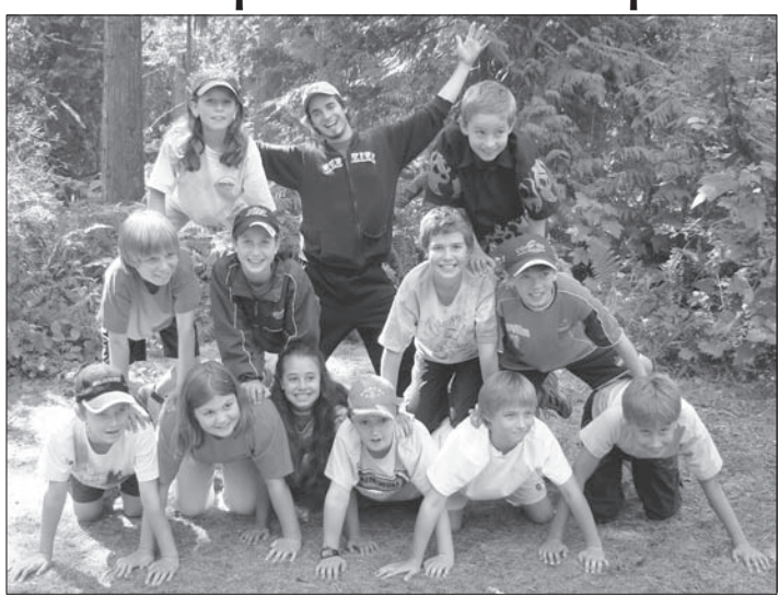
Many happy memories await CPF members who attend BC Family French Camp.