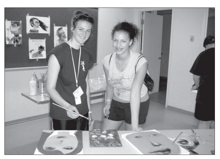
Les jeunes artistes at Rencontre Française 2008.

Message from the Executive Director, continued from page 4