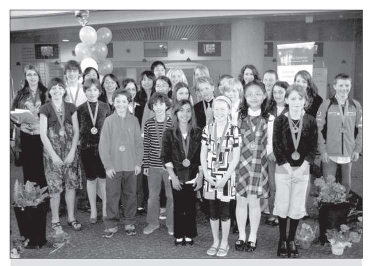
In 2008, Concours d'art oratoire turned 25. A record 289 students in grade six to twelve impressed the judges with their superb oratory skills. For the first time, 10 students from Intensive French were welcomed and presented with certificates of participation.

■ Last October we offered the first ever Rencontre en Plein Air, a weekend of outdoor adventure at the Centre de leadership et d'aventure en nature (CLAN) in Powell River. With 33 French immersion and francophone students in grade 7 and 8 participating, it was an excellent inaugural event and the start of a new tradition.